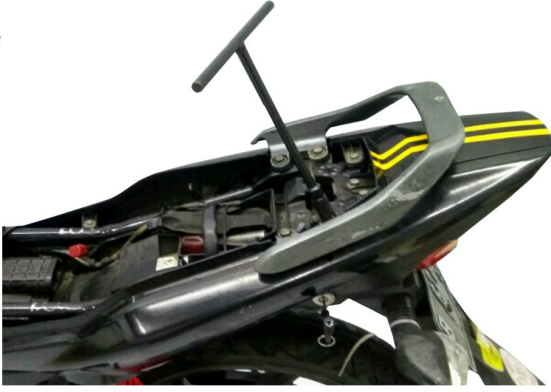
Disassembly the handle pillion from motorcycle (Lepaskan handle pillion dari bodi motor)