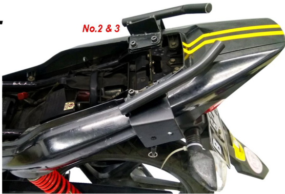
Assembly No.2(Upper&Lower KIT) with No.3 (Bolt M8xL55) (Pasang No.2(Upper&Lower KIT)dengan No.3(Bolt M8xL55))