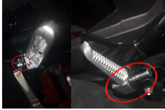
Disassemble the pin and plain washer of the pillion step. (Lepaskan kawat besi dan pin baut dari pijakan kaki)